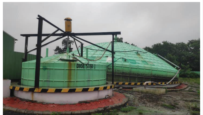
Figure 6: The bio-methanation facility opposite the vegetable and fruit market. Organic waste is converted to fuel used by city buses and as cooking fuel.

Recycling: This process converts wastes into new products. The materials generally includes glass, paper, electronics, textiles, plastic, metal, etc. It is considered as the key element of modern waste reduction.