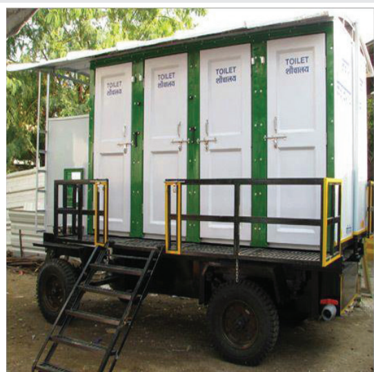
Figure 5: Mobile toilets at Indore GTS.

Around 20 tons of waste is gathered each day and changed over into 750–800 kg of bio compressed natural gas (bio-CNG), said Mahindra Waste to Energy Solutions Ltd. The organization has an agreement with the IMC to work the plant for a long time.