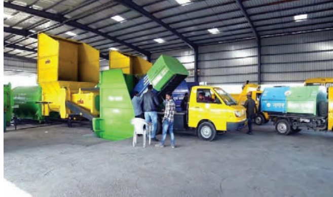
Figure 4: The transfer stations.

Open defecation is because of the lack of toilets and awareness of individuals. Besides this, awareness of toilets was significant in the mission ODF. In October 2016, NGOs were signed by the IMC with strict rules of turnover and urban planning experience. The fundamental responsibility of NGOs was to identify key ODF spots in and around the city.