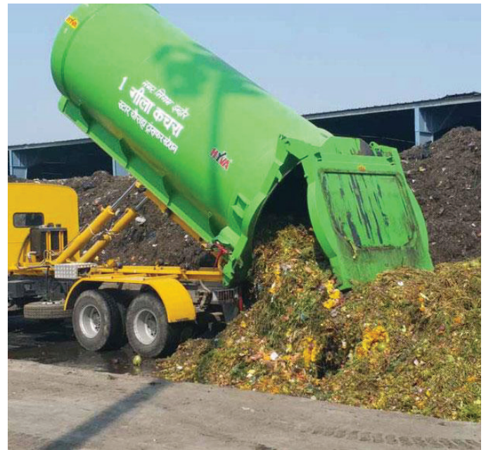
Figure 1: Wet waste collector (Dumper).

The wet waste gathered by the door to door system vehicles is taken by the tippers to one of the eight exchange stations. At the GTS, the tippers empty the wet waste into committed compactors that pack and load of the wet waste on devoted hook loaders. The details of all the approaching waste gathering vehicles are signed in the logbooks at the GTS. The mass assortment vehicles don't travel out to the GTS however directly to the processing plant in the wake of finishing their