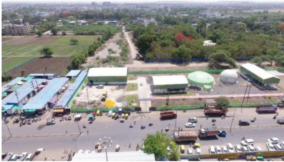
Figure 8: Choitram Mandi, Indore.