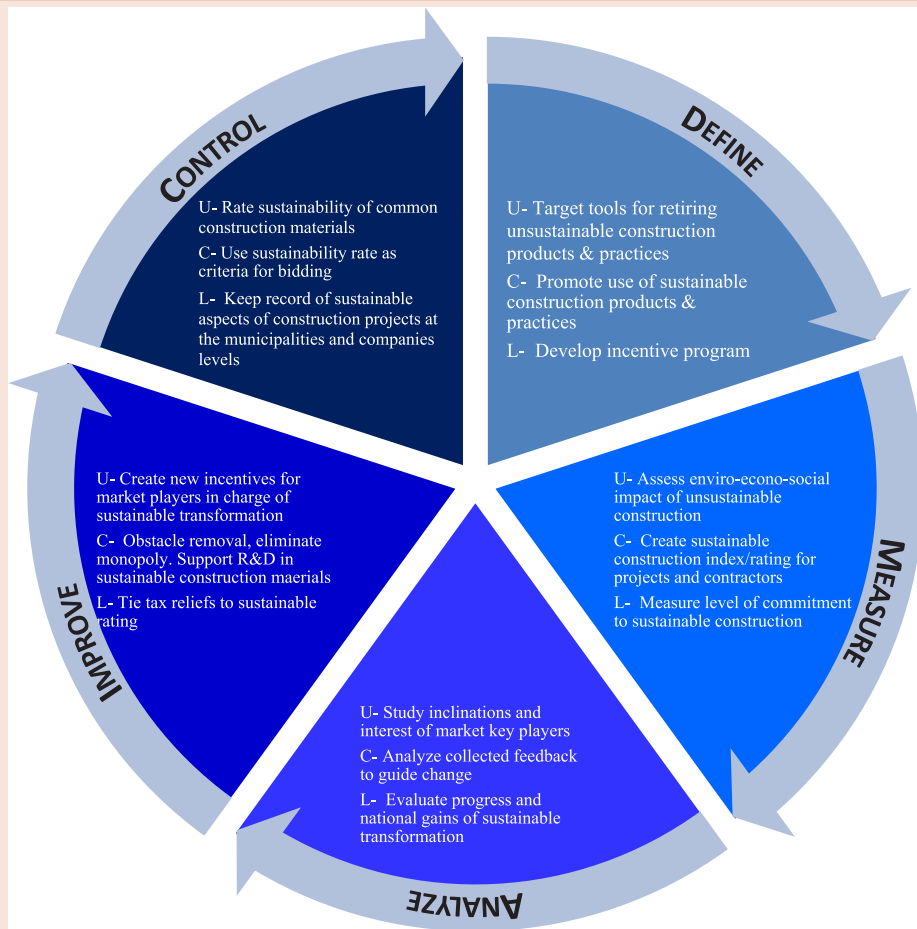
Figure 3: Incorporation of Six Sigma DMAIC into Kotter's Model to change stagnant construction cultures. (U: unfreezing; C: changing; L: locking success).